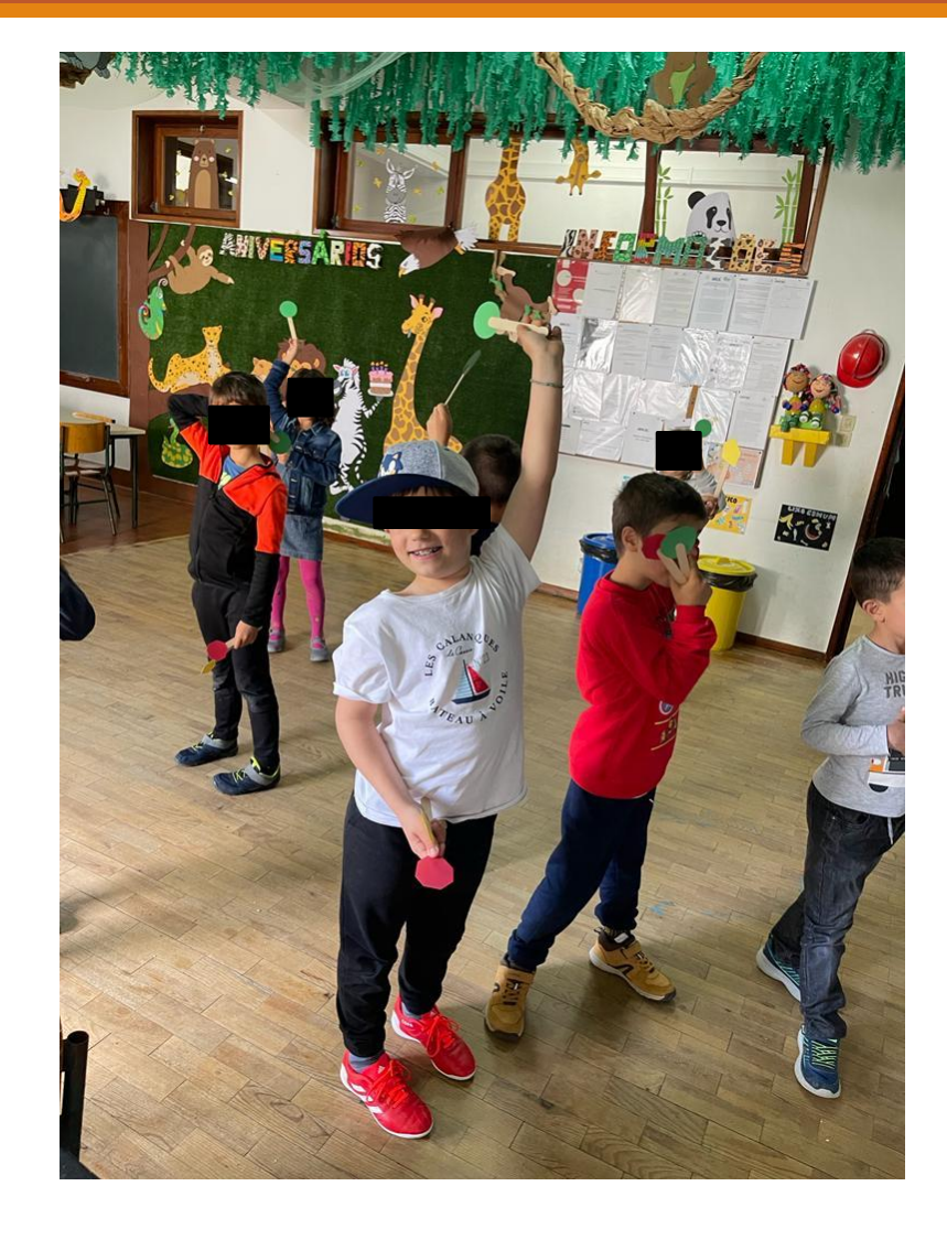
"Walk the Talk"