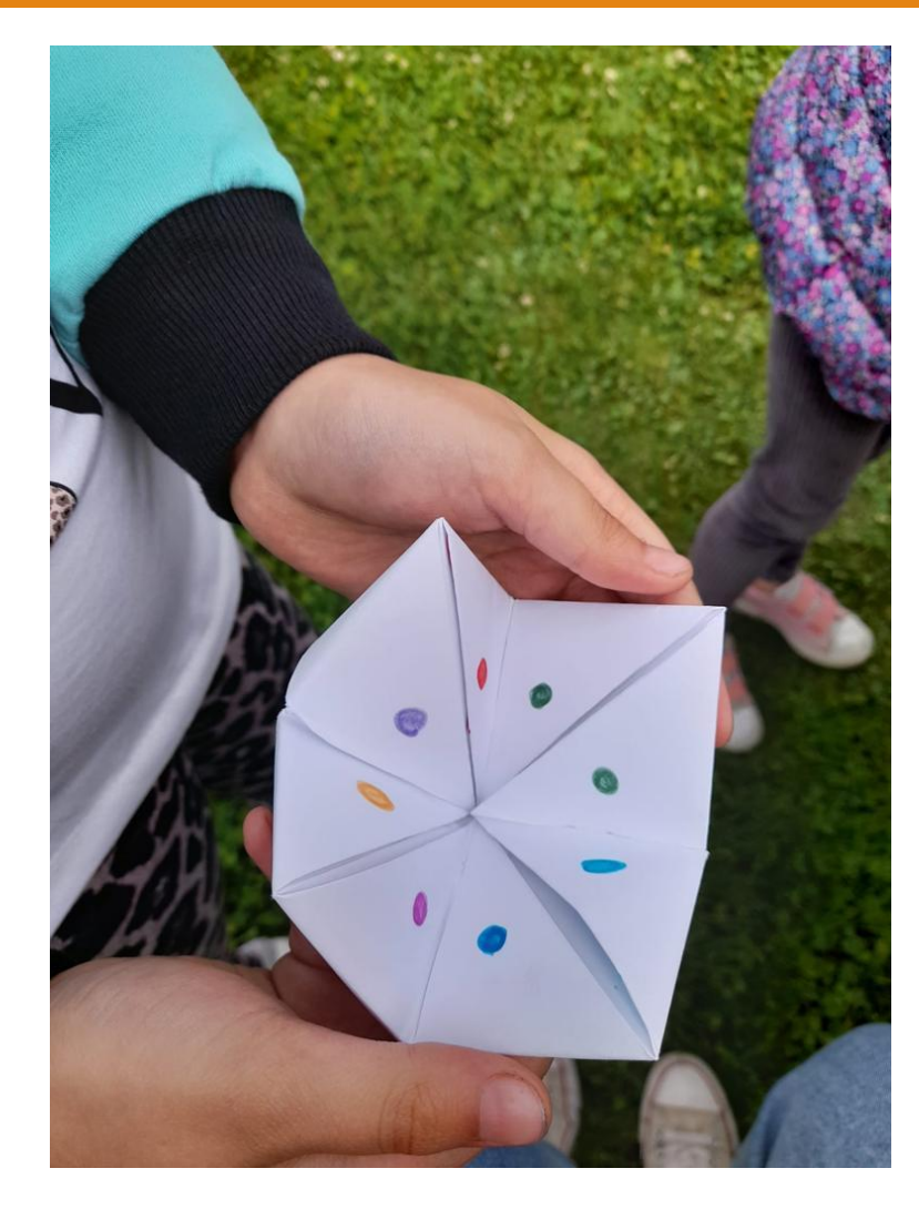
"Giving and Receiving"