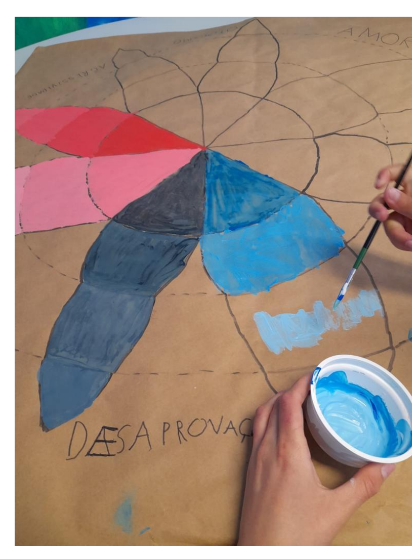
"Tree of Emotions"